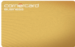
Cornercard Business Gold