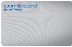
Cornercard Business Classic