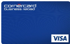
Cornercard Business Prepaid